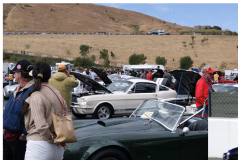
Views from SAAC-35 Sonoma, CA, 2010

PRESORTED STANDARD U.S. POSTAGE PAID PERMIT #267 BLOOMINGTON, IN